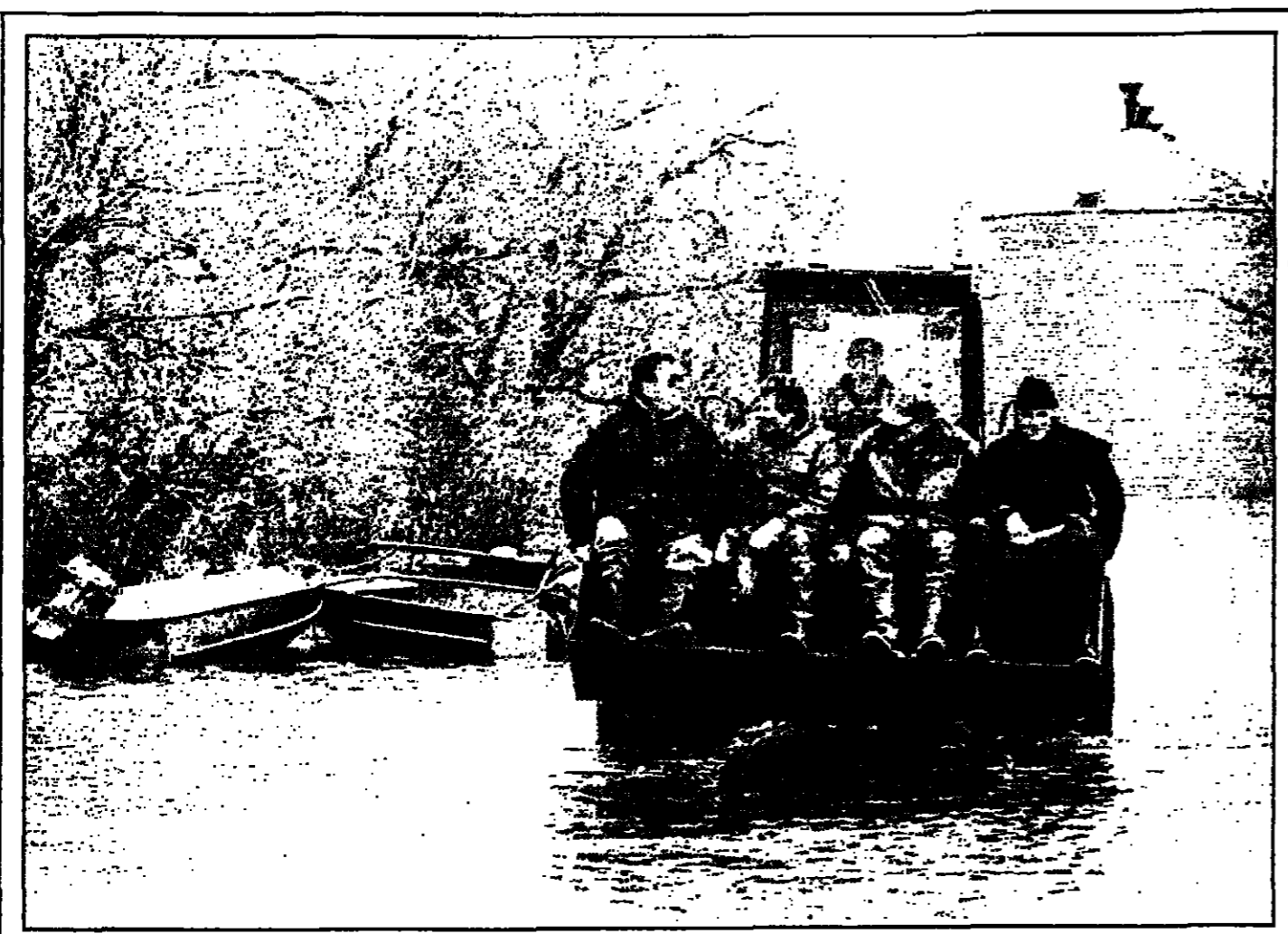
Manitoba farmers return from reinforcing a dike near Niverville yesterday in the bucket of a front-end loader.